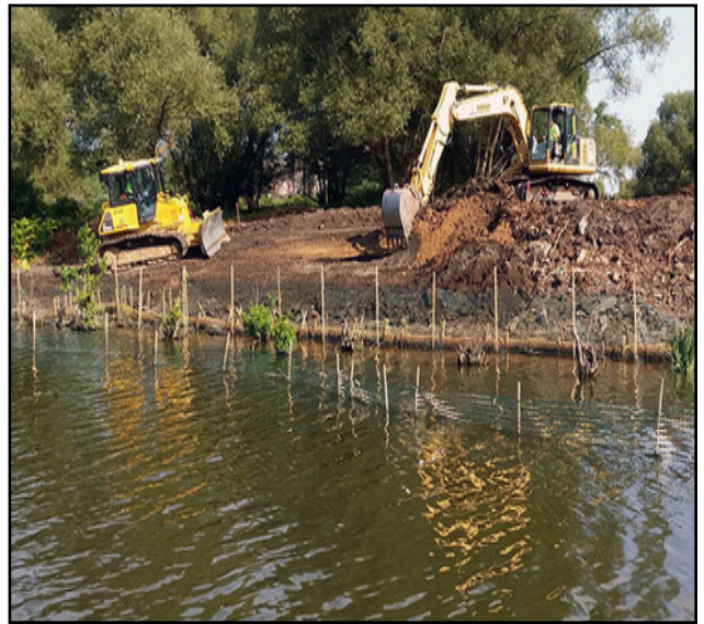
Work underway at the Toe of Katherine Street Peninsula project site, a habitat restoration project in the Buffalo River Area of Concern.