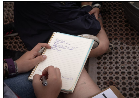
A Girl Scout records data on a field trip with the Stone Laboratory at The Ohio State University.

Prior to developing this Guidebook , the board identified resources and best practices for participatory science. That research noted that current participatory science efforts can often become fragmented, issue- or area-specific products that are less accessible to inform decisions about the Great Lakes. Many groups develop their own approaches of data entry, analysis, visualization and reporting using a variety of sources and best practices. Efforts to align participatory and professional science can ultimately enhance the collective impact of participatory science. The board's Great Lakes Participatory Science Guidebook will be adaptable to help connect volunteer scientists with practitioners to identify areas of shared interest and promote opportunities for regional collaborations.