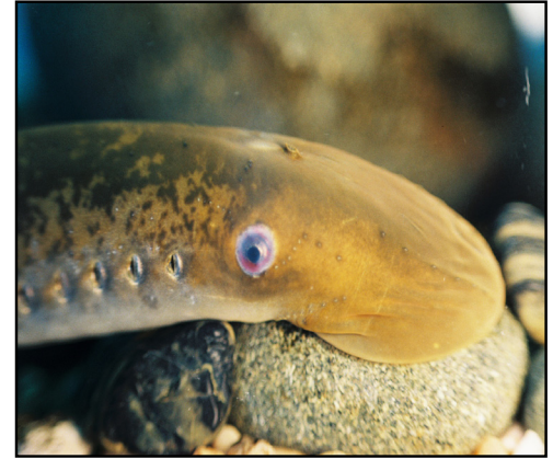
A close-up image of a sea lamprey, an invasive species in the Great Lakes.

In 2023, the board proposed a decision-making framework that an early warning system could use to assess threats, and determine which threats require action. The board is currently pursuing a pilot study of the Great Lakes Early Warning System .