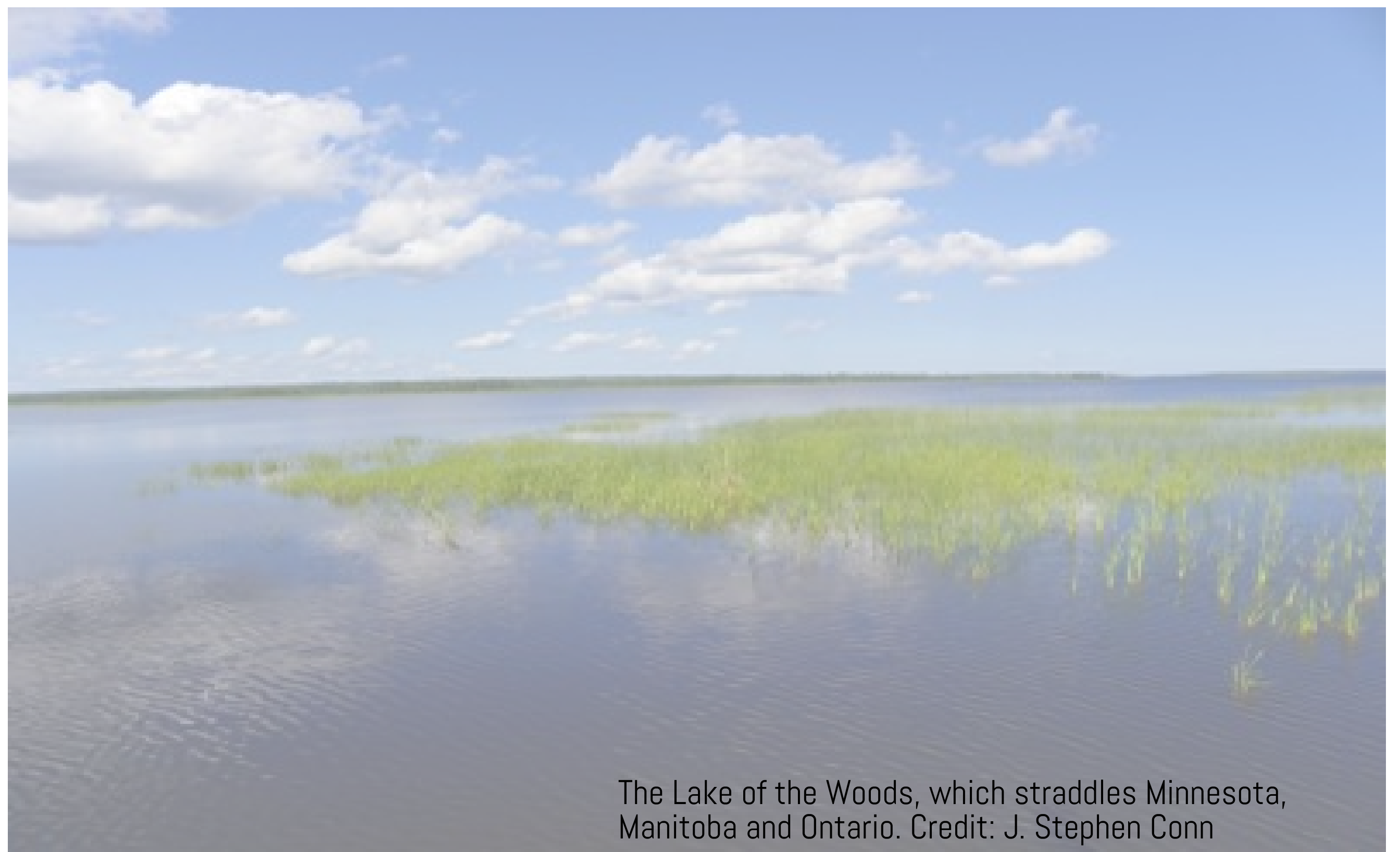
The Lake of the Woods, which straddles Minnesota, Manitoba and Ontario.

Adaptive Management Committee: established in 2020 to monitor whether the latest rule curves perform as expected.