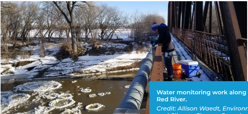
Water monitoring work along the Red River.

To understand the potential for drought conditions in the basin, a project now underway uses a statistical model to derive a series of possible streamflow scenarios over various time spans for the Red River and its tributaries. The results will be used to characterize the potential for periods of extreme low flows and help inform preparedness actions over the next 50 years.