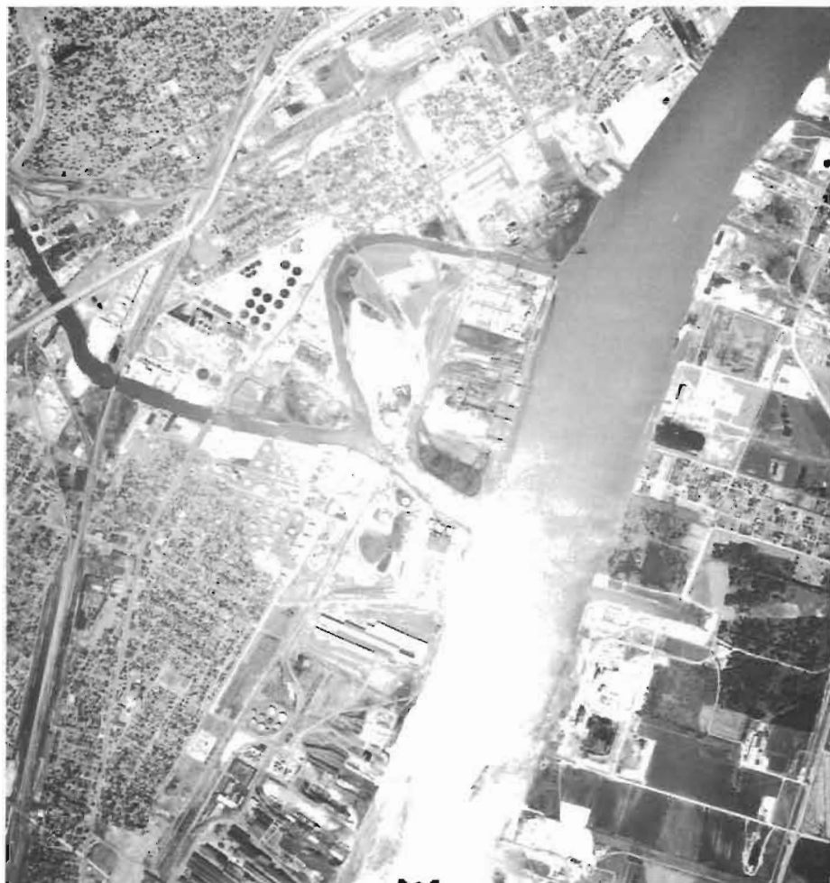
The Rouge River flows around Zug Island and enters the Detroit River.

out the watershed and at known and suspected pollution sources to help quantify local impacts and effects on the river as a whole.