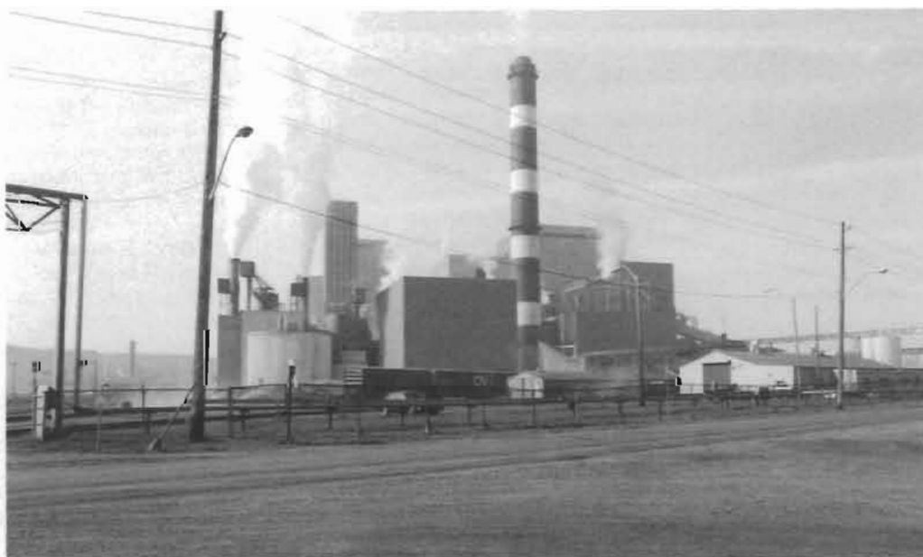
The Province of Ontario's goal is zero discharge of organochlorines from pulp and paper mills by 2002.

The Storm Drain Marking Program aims to protect fish habitats and was originated in Canada in 1986 as a joint