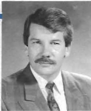
Jean Doré, Mayor of Montréal.

port of all municipalities. The integration of the North American economy also raises questions about the changing role and future of marine transport and our port facilities. Finally, the towns in this region like most of their American and Canadian counterparts, recognize the need to maintain and redesign aging infrastructure.