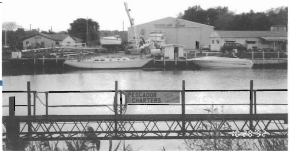
The recreational boating industry in the Ashtabula River is concerned about contaminated sediments, which have resulted in local dredging restrictions.

In the past four months, the International Joint Commission has conducted review meetings for Stage 1 Remedial Action Plans in four of the Great Lakes connecting channels Areas of Concern: St. Lawrence River at Massena, New York and Cornwall, Ontario, and the binational RAPs on the St. Marys and St. Clair Rivers . The meetings form a central part of the Commission's RAP review process and bring together members of the local RAP team, public advisory committee, technical reviewers,